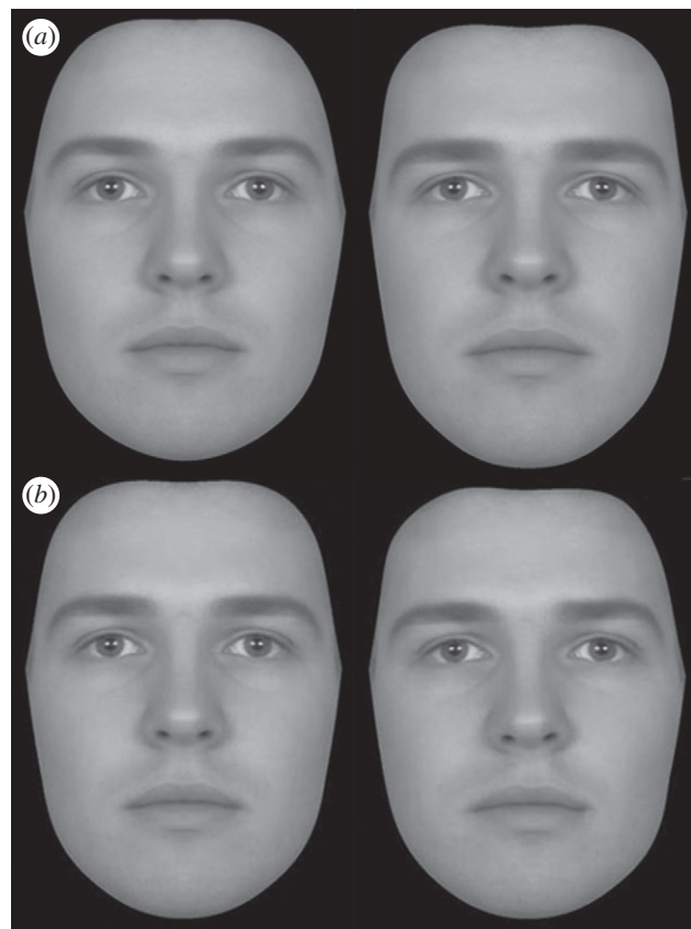
Figure 1. (a) Feminized (left) and masculinized (right) male faces. (b) Symmetric (left) and asymmetric (right) male faces.

To measure preferences for sexually dimorphic features, we used pairs of composite face images. The pairs comprised one masculinized and one feminized version of the same face (figure 1). Images were manufactured from 50 young adult Caucasian male and 50 female photographs. Composite images, composed of multiple images of different individuals, were used as base faces (10 male and 10 female composite images each made of five individual images). The composite images were made by creating an average image made up of five randomly assigned individual facial photographs [19] (this technique has been used to create composite images in previous studies; see [58,59]). Faces were transformed on a sexual dimorphism dimension using the linear difference between a composite of all 50 male faces and a composite of all 50 female faces (following the technique reported by Perrett et al. [20]). Transforms