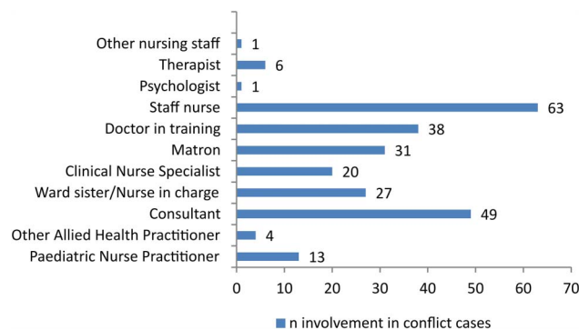
Figure 1 Staff involvement in conflicts experienced.

difficulties 18 and religious beliefs. 19 Other studies have suggested that conflict may arise when relatives are not fully supported to understand treatment and care decisions. 20 Underpinning each of these causes can be different understandings of the clinical situation 21 and different interpretations of futility 22 and likely prognosis. 11