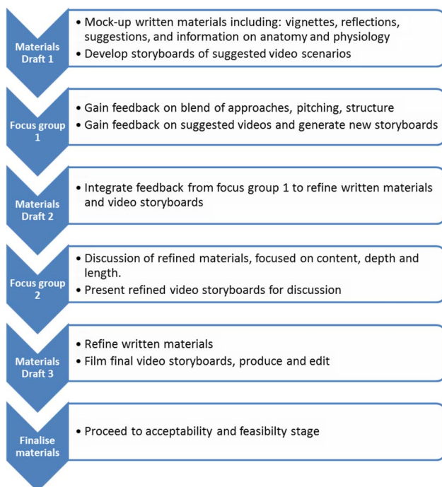
Figure 1 Intervention development process.

The education package will be framed around case studies of carer–patient dyads. These dyads will facilitate