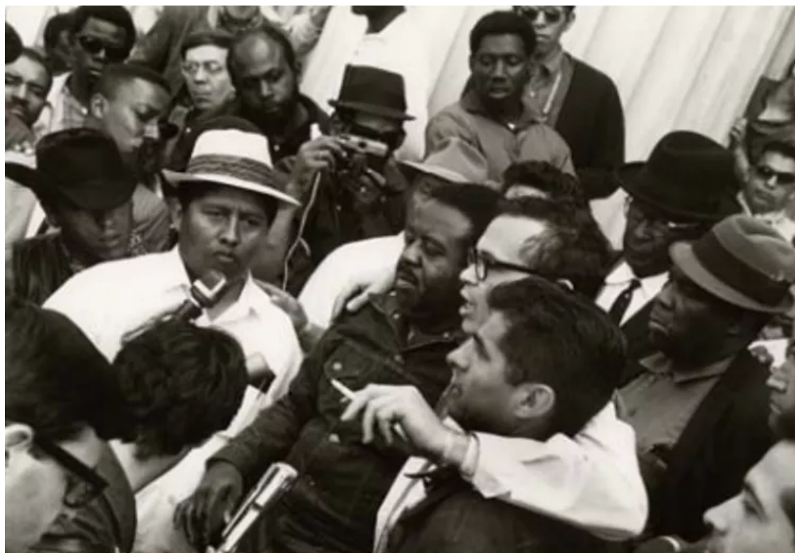
Native American activists join Martin Luther King's Poor People's Campaign on a march in Washington DC in 1968.

University of New Mexico Center for Southwest Research