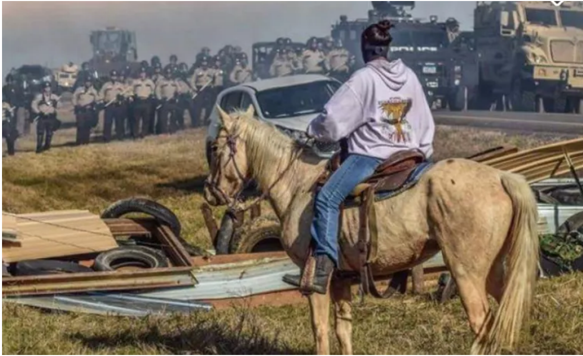
A Native American protester faces police at Standing Rock Reservation in 2016. The campaign against the $3.8bn Dakota access pipeline continues.